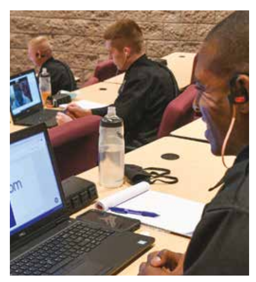
Expanding Our Horizons, a cultural awareness experience training

Kalamazoo Valley will welcome 26 men and four women to its 92<sup>nd</sup> Police Officer Training Academy later this month, its largest recruiting class in years.