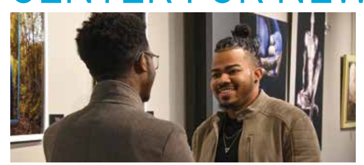
2nd Annual Black Arts Exhibit

Kalamazoo Valley's Center for New Media, located at 100 E. Michigan Avenue in downtown Kalamazoo, hosts art exhibits during Kalamazoo's monthly Art Hop events. Art Hop is normally held on the first Friday of each month and the CNM is open from 5:30 - 8 p.m. during Art Hop. Exhibits remain on exhibit through the end of each month.