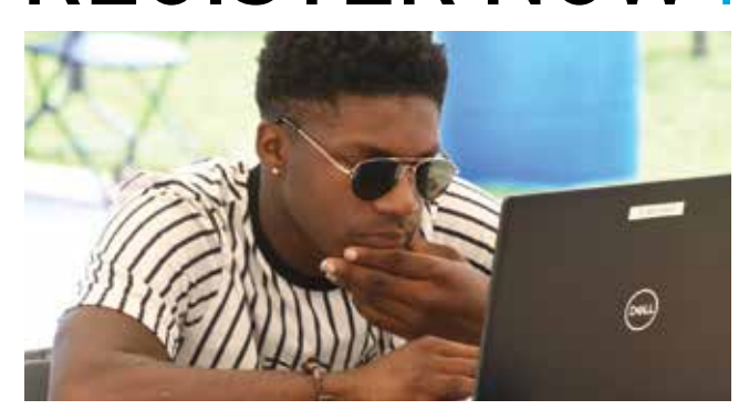
Student registering for classes

Fall semester at Kalamazoo Valley Community College begins Sept. 8 and there is still time to register for classes.