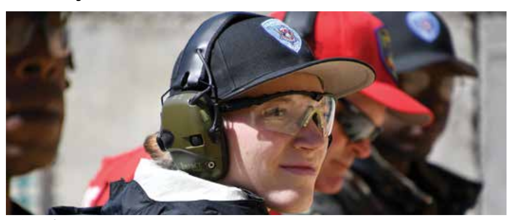
Cadets at firearm training

Applications for the January 2022 academy will be accepted beginning Sept. 7. For more information, visit www.kvcc.edu/police.